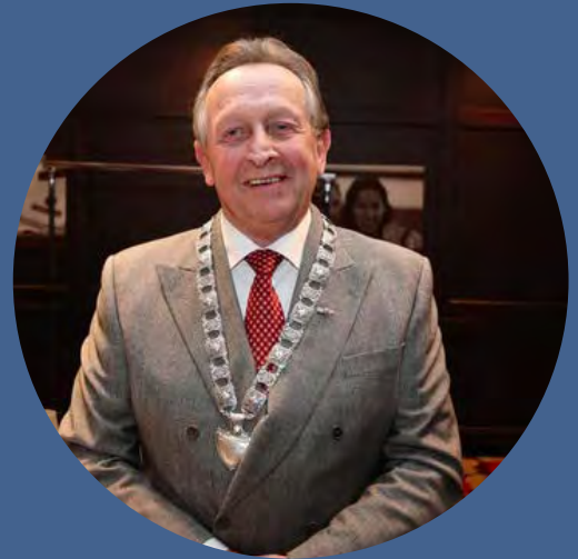
IPA Netherlands Gimborn Seniors