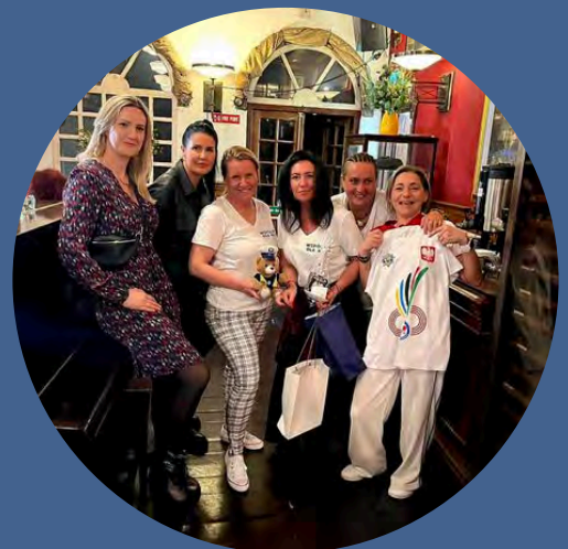
Study Visit of Polish Policewomen in Ireland