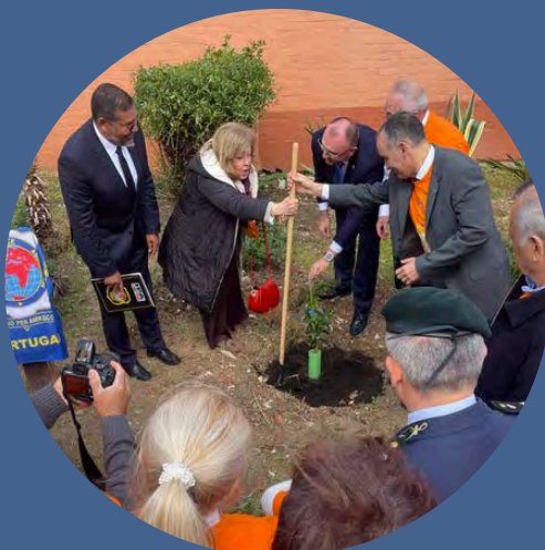
IPA Portugal Orange the World