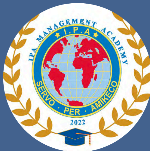
How Do You Manage A Volunteer Association?