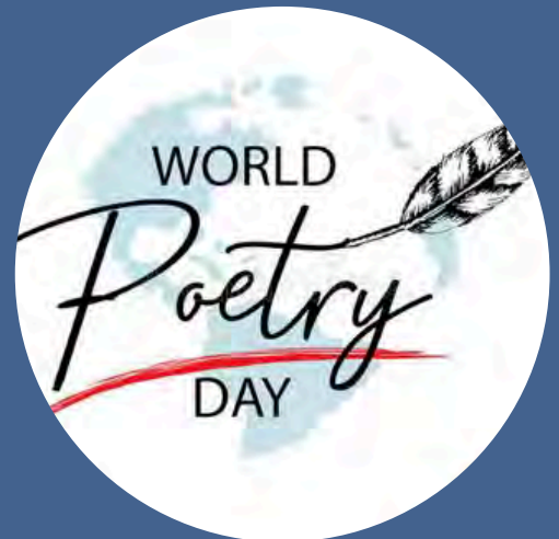
IPA World Poetry Day